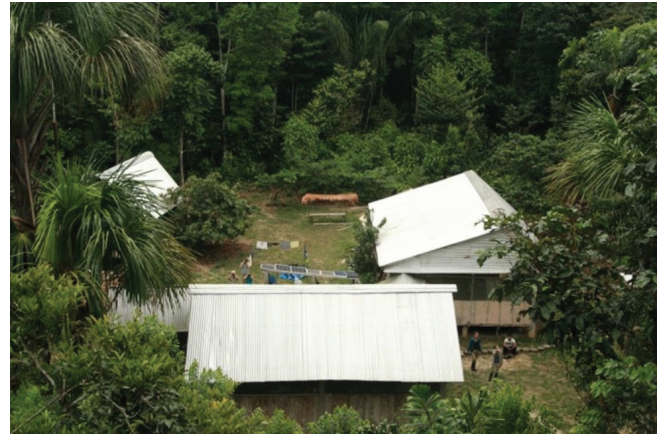
Figure 3. Aerial view of the EBQB buildings.

Electricity is provided by seven solar panels. Very clean drinking water is available from a small creek 50 m downhill from the buildings. EBQB owns two small motor boats run with a 15 hp or a “peque-peque” motor.