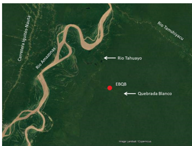
Figure 1. EBQB is located in an area of little disturbed to undisturbed forest.

The Estación Biológica Quebrada Blanco (EBQB) is one of very few research stations in the region of north-eastern Peru bounded by the rivers Amazon/Ucayali to the north and west and Yavarí to the east. This interfluvium includes large stretches of remaining little or undisturbed lowland rainforest (Fig. 1). It is a region of high biodiversity