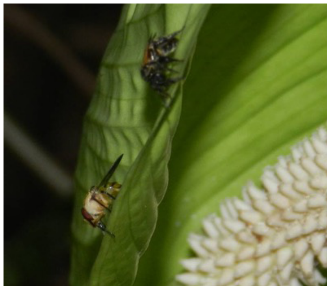
Figure 2. Wasp (top) and fly (bottom) on spathe of Spathiphyllum grandifolium ENGL.

Fruit-set of the bagged inflorescence as well as in the randomly selected infructescences was 100 %. Seed-set of the bagged inflorescence was five seeds/ fruit ( 5 \pm 1.07 ; N = 20 ), similar to the unbagged ones ( 6 \pm 1.22 ; N = 100 ).